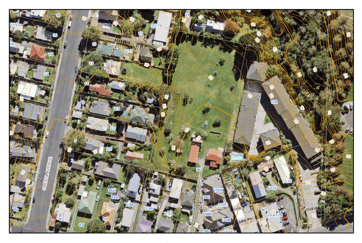
Figure 1. Aerial view of Subject Site – Council Geomaps

96 Beach Haven Road Lot 1 DP 157383 Area = 2,251m^2 13 Cresta Avenue Lot 2 DP 157383 Area = 4,896m^2