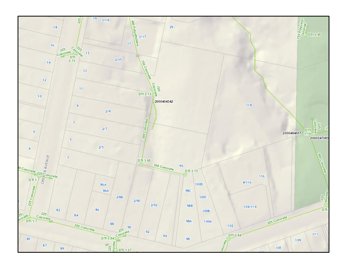
Figure 4. Existing Public Stormwater Network (Auckland Council Geomaps)